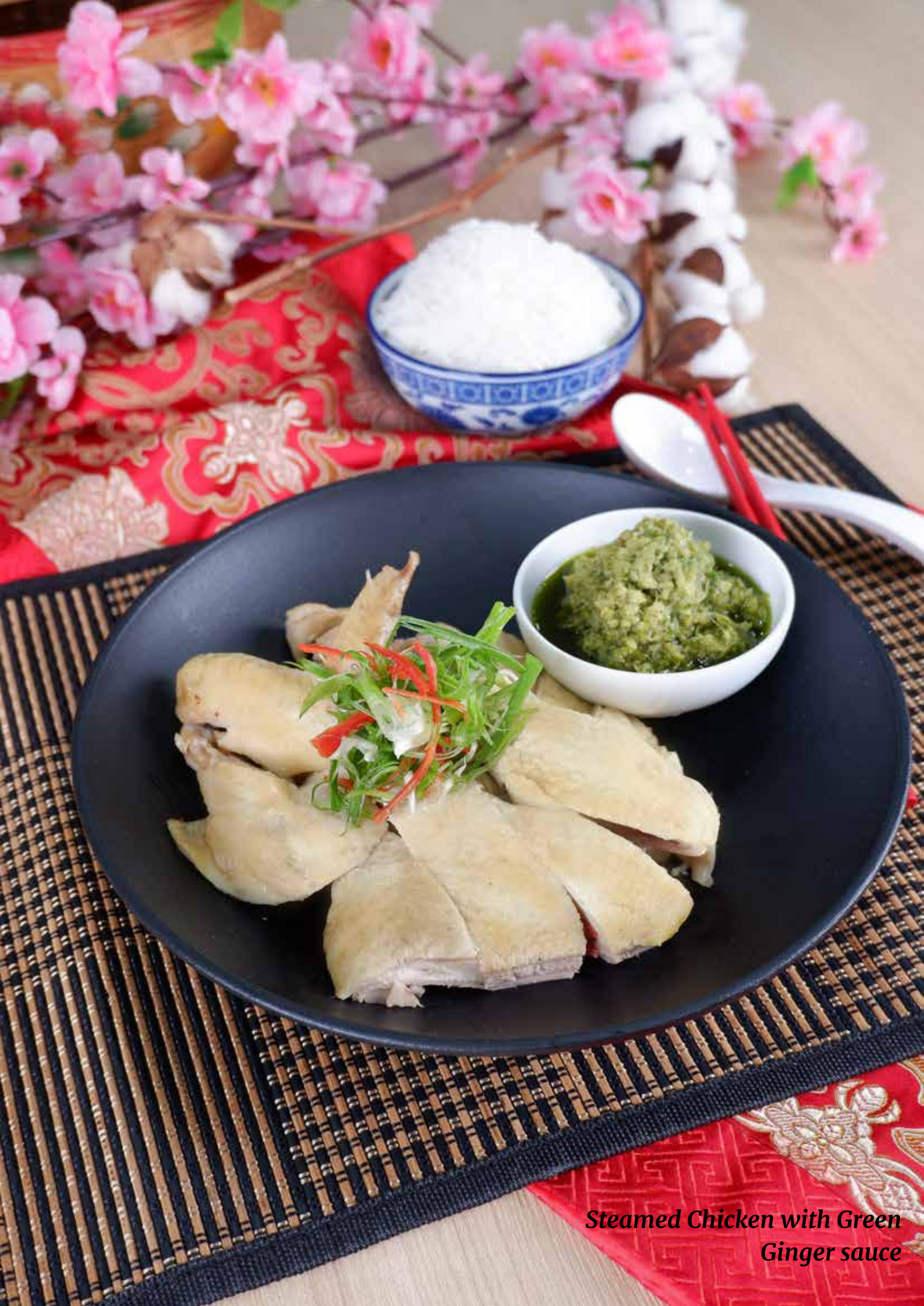
Steamed Chicken with Green Ginger sauce