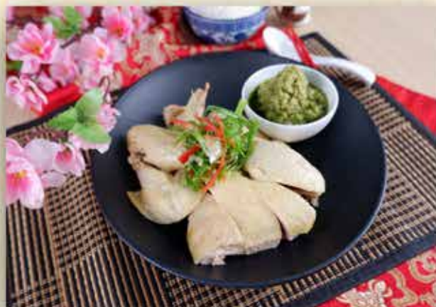
Steamed Chicken with Green Ginger Sauce