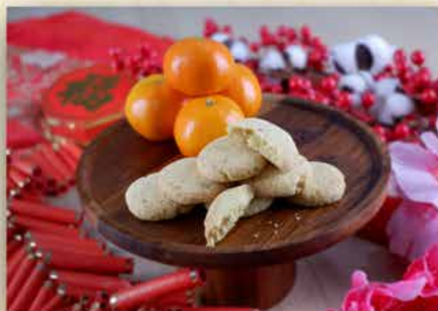
Mandarin Almond Cookies