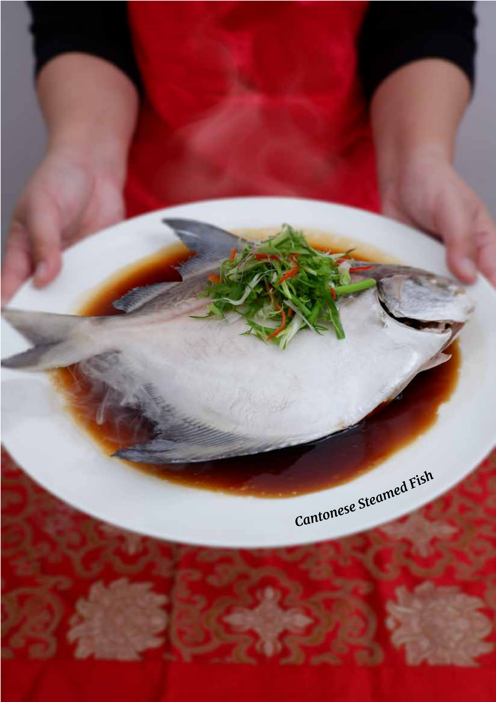
Cantonese Steamed Fish