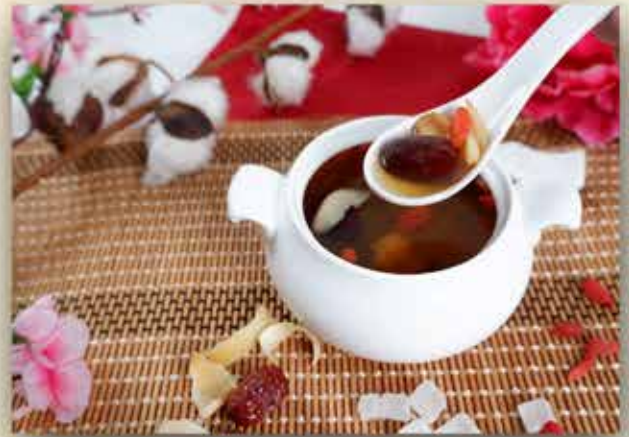
Lotus Seed with Lily Bulb Dessert Soup