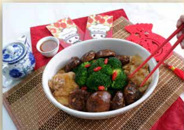
Braised Mushroom with Broccoli and Beancurd Sheets