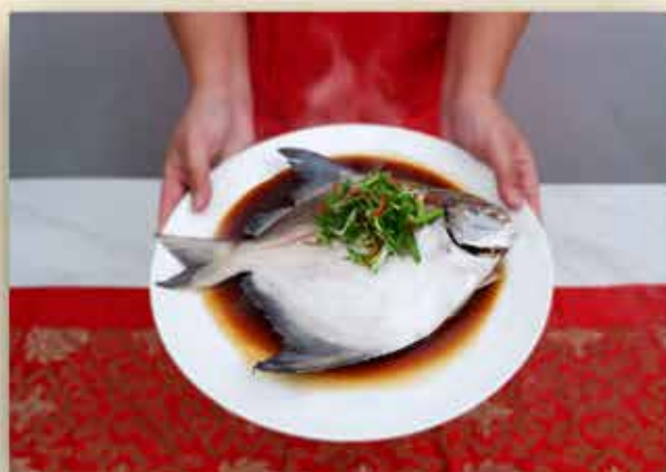
Cantonese Steamed Fish