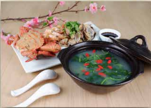
Steamed Seafood Tower