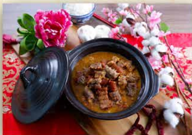
Braised Sea Cucumber with Roast Pork