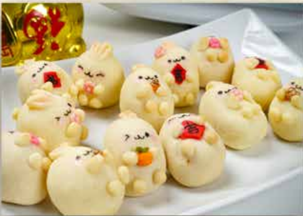
Rabbit Shaped Pineapple Tarts

Try making these 9 dishes that are perfect for Chinese New Year gatherings with your loved ones!