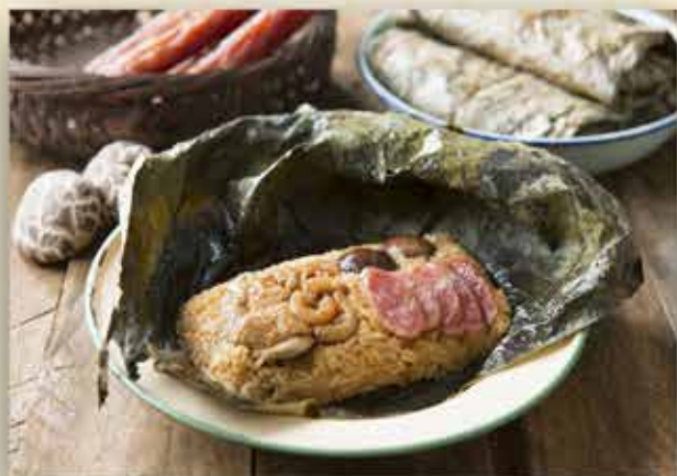
Lotus Leaf Glutinous Rice